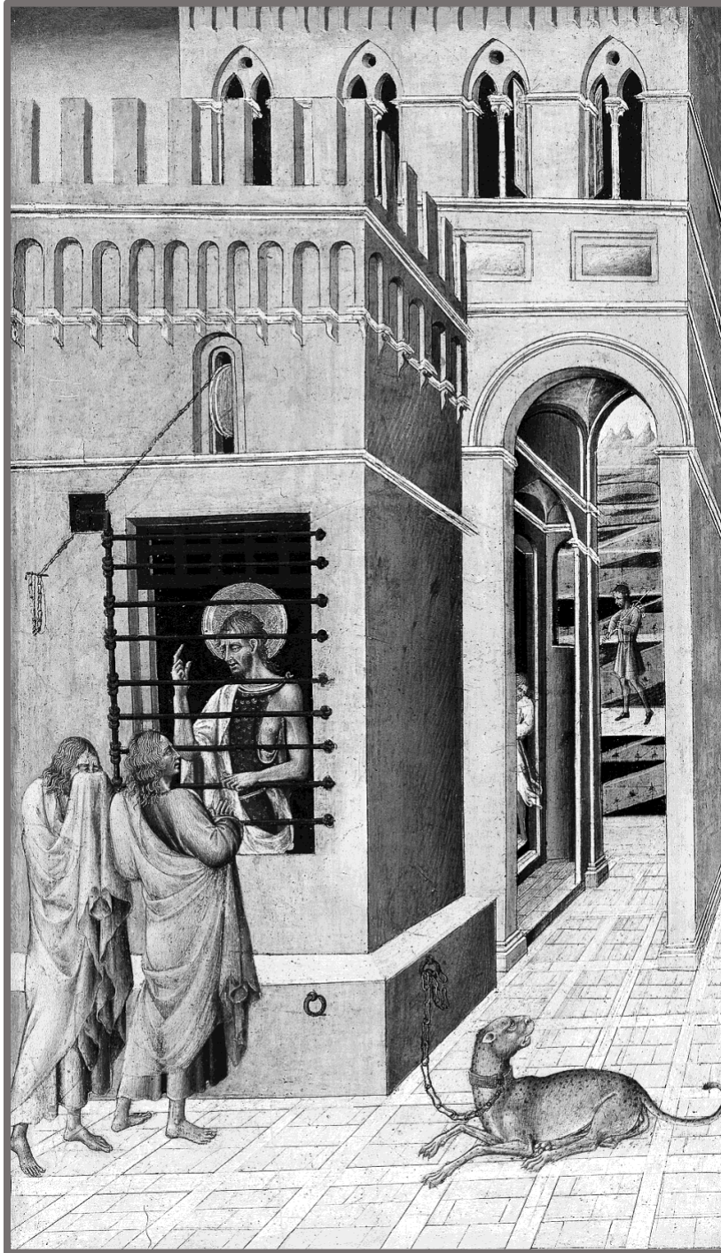
John the Baptist in prison, visited by two disciples Giovanni di Paolo Tempera on panel, ca 1455

THE HOLY EUCCHARIST THE THIRD SUNDAY OF ADVENT DECEMBER 14, 2025