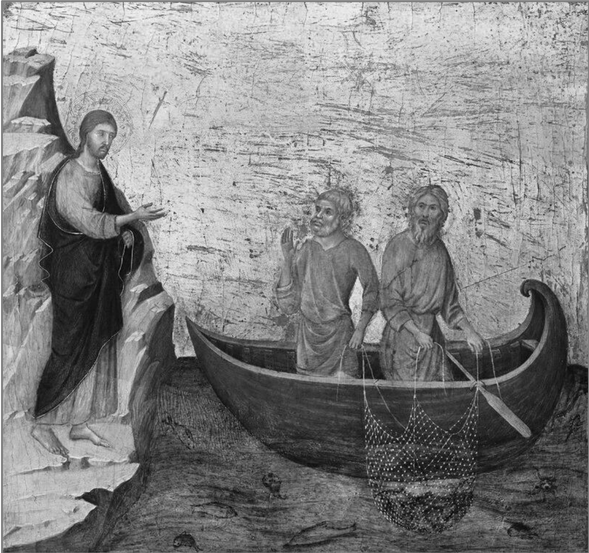
The Calling of the Apostles Peter and Andrew, ca. 1310, Duccio di Buoninsegna, from the Maestà altarpiece of the Mary of the Assumption Cathedral, Siena, Italy, now in the National Gallery (U.S.)