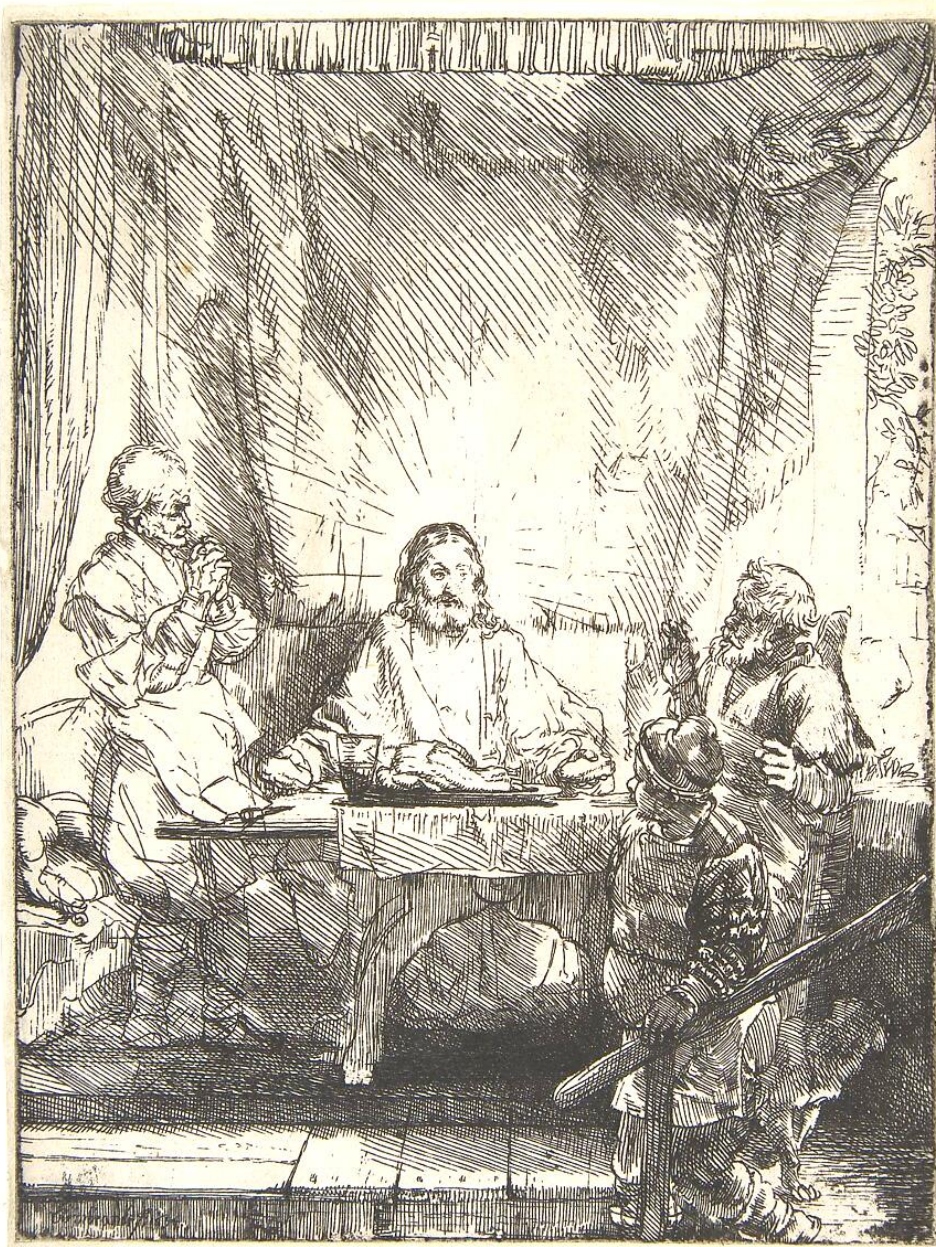
The Supper at Emmaus , Rembrandt, 1654, Metropolitan Museum of Art, NYC

THE HOLY EUCHARIST THE THIRD SUNDAY OF EASTER APRIL 19, 2026 8:00 AM & 10:00 AM