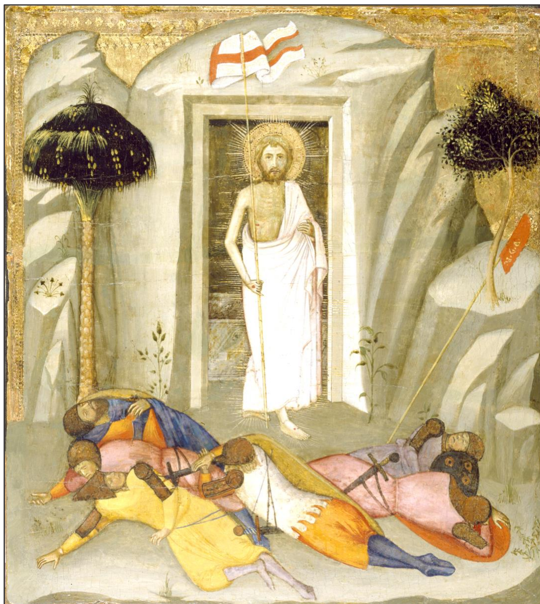
The Resurrection, Andrea di Bartolo, ca. 1400