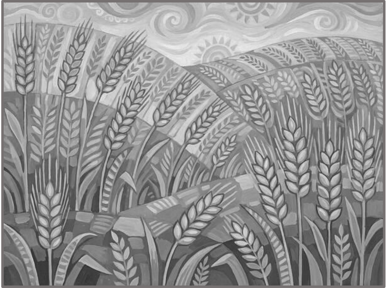
Golden Wheat Fields Under Blue Sky , Thomas Breval

THE HOLY EUCHARIST THE EIGHTH SUNDAY AFTER PENTECOST JULY 19, 2026 + 9:00 A.M.