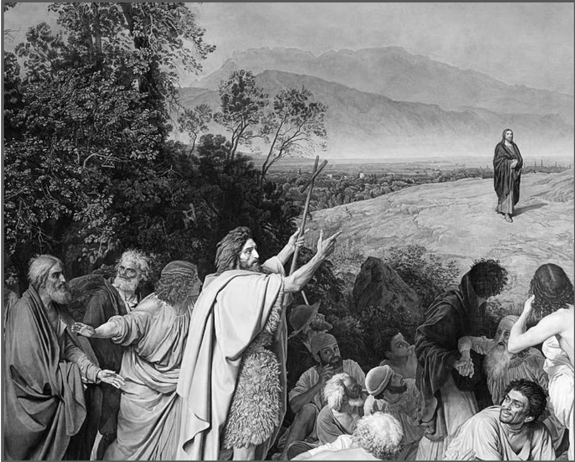
Detail from The Appearance of Christ Before the People , 1857 Alexander Andreyevich Ivanov, Tretyakov Gallery, Moscow