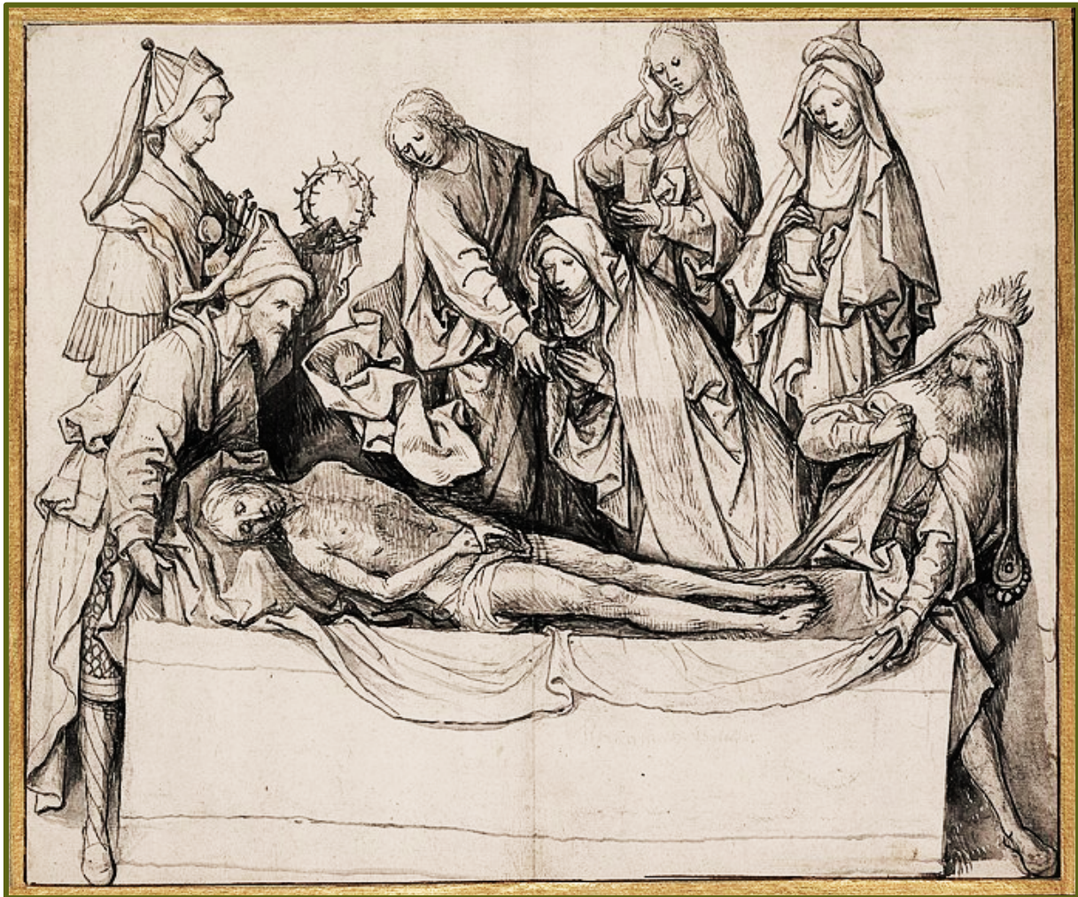
The Entombment , grey wash, Hieronymus Bosch, ca. 1507, British Museum